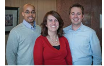
Left: A Marathon Pipe Line strategy conference. Right: MPC recruiters.